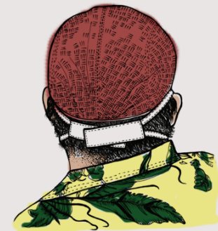
PULLING STRAPS UP BEHIND HEAD FASTEN THE VELCRO AT THE BACK OF YOUR HEAD