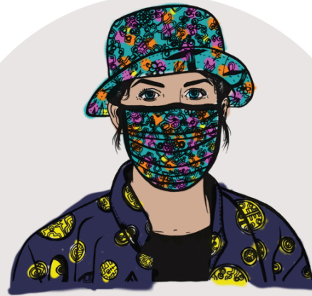
PRESS THE NOSE WIRE ON THE TOP FRONT OF THE MASK TO SHAPE ON YOUR NOSE AND CHEEKS FOR A TIGHTER FIT