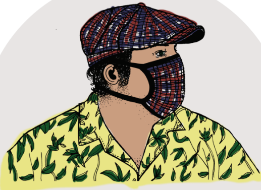
POSITION MASK TO FIT SNUGGLY AROUND CHIN. ADJUST FIT IF NEEDED BY TIGHTENING SIDE STRAPS WITH A KNOT