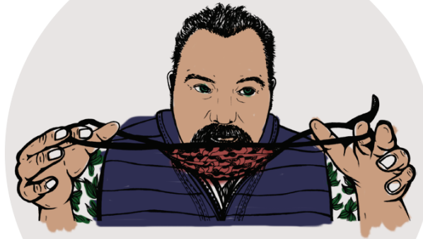
KEEP HANDS AWAY FROM FACE WHEN PUTTING ON MASK